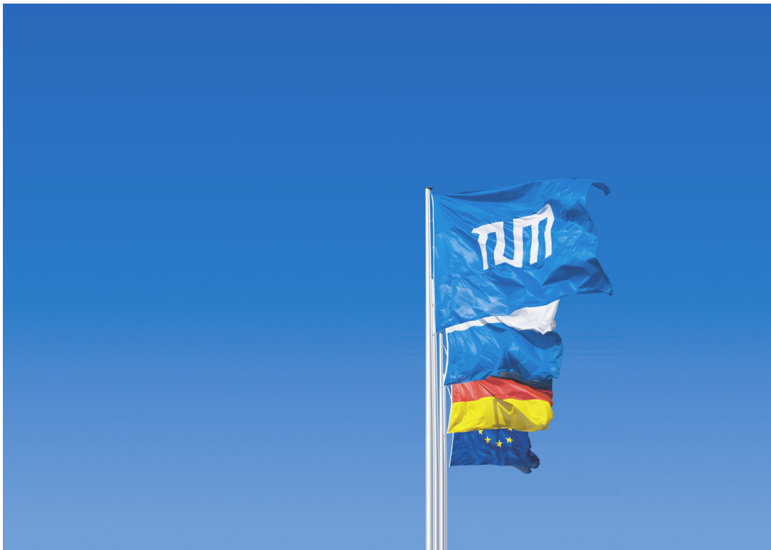
Figure 2 TUM flag